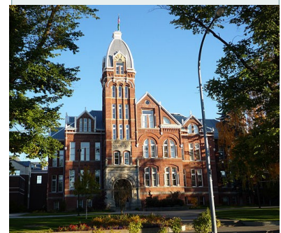
Iconic Barge Hall, Central Washington University